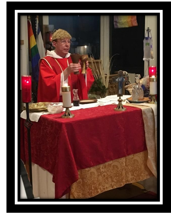
Holy Week 2018